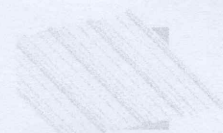
Side Sheet Metal