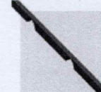
Outside Closure Strip