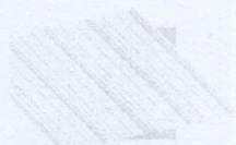
Roof Sheet Metal